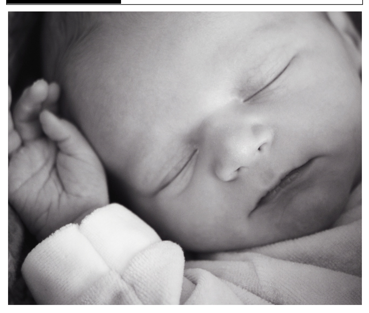
A Summary of 16 Key Informant Interviews

COLORADO DEPARTMENT OF PUBLIC HEALTH AND ENVIRONMENT